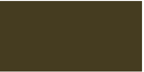
104 Burnt Umber