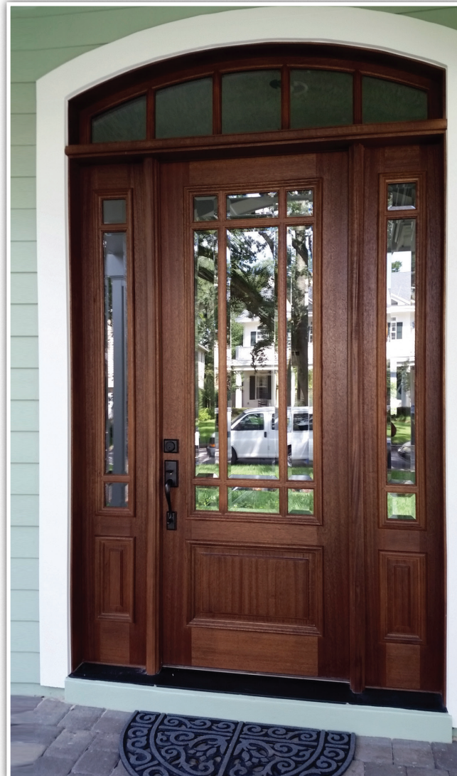
Porch Enclosures, Stained Doors, and Interior Spaces photos courtesy of Max Babichenko, Modern House Improvement.

Interiors Protects painted surfaces, bare wood, oil and water base stained wood, columns, cabinetry, mantels, wainscot, wood paneling, crown molding, baseboards, chair rails, and furniture. It is a perfect clear coat for faux marble and wood grained surfaces.