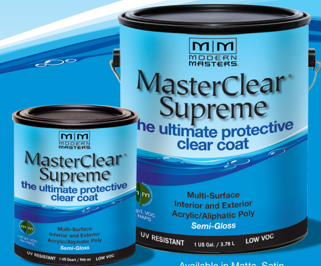
Available in Matte, Satin, Semi-Gloss, Gloss