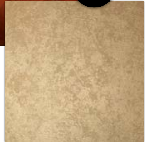
Metallic Paint Collection Blackened Bronze Matte & Satin Metallic Finish

It's easy to create a shimmering tone-on-tone metallic finish using the same color in 2 different sheens. There are 15 Matte Metallic Paint colors to choose from.